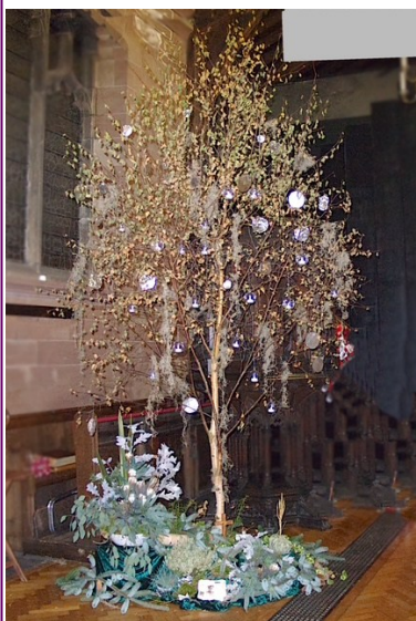
The finished Remembrance Tree in situ