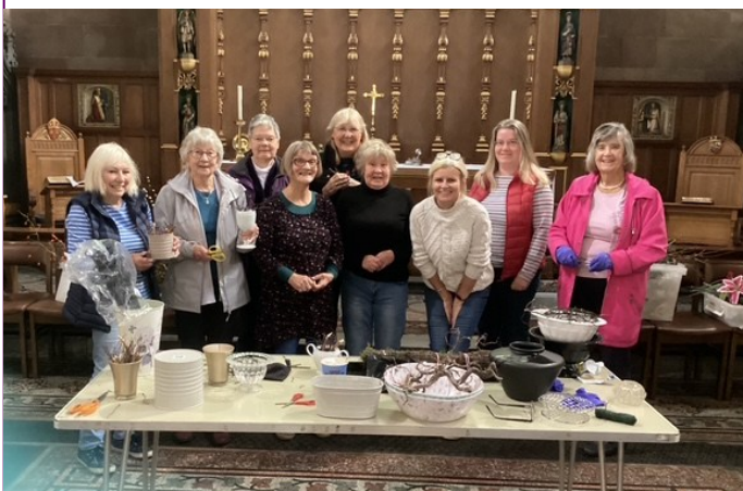
The regular team, plus one or two extras!

Over the years new techniques and ideas came in, particularly relating to sustainability and environmental issues, and about 9 years ago we stopped using floral foam - and so began sometimes frustrating sessions, as flowers and foliage fell over, as the compostable mechanics collapsed. However, the great team soldiered on!