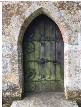
Church of the Holy Trinity, Chilfrome, Dorset

Just take a pic., give the name and location of the church, and we can publish them all in our August / September newsletter. We'll also get to see who has travelled where!