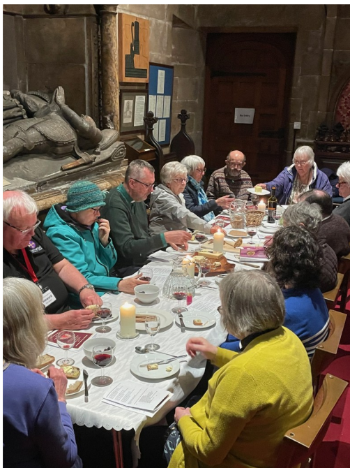
The sharing of the 'Agape Meal'