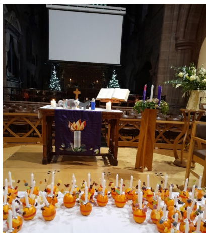
At the Christingle Service