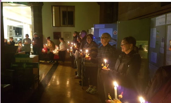
Waiting for all the lights to be turned off