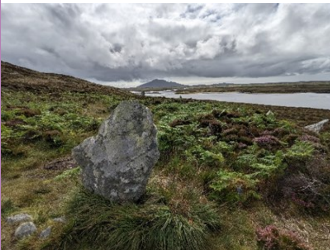
Pobull Fhinn, Langaig, Outer Hebrides Be still and know that I am God Psalm 46:10

In today's society, which promotes activity and instant gratification, we have forgotten how to wait and how to be present. There is a lack of attention as we are distracted by what we see on screens, thoughts about what is happening in the world, bombarded by our "to do" lists, and many other things that keep us from being present. Sometimes, especially as we age, we can spend a lot of time on our own. This time doesn't always translate into being able to be present in the waiting. We can still be overtaken by worries and concerns including about our health and abilities and how we are going to manage. We also get impatient, stressing about wanting to "hurry up".