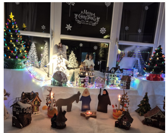
Mary, Joseph and the donkey surveying the winter wonderland at the Bradbury house.

But I do know this. They all nourished me and gave me the strength I needed to do my work. If my wife hadn't given me those meals, I'd be physically dead today. Likewise, if I hadn't gone to church, I'd be spiritually dead today.