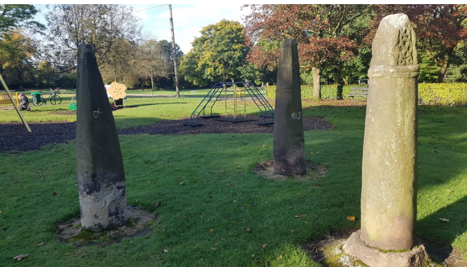
These are clearly not in the Savage Chapel but in West Park!

About 6 months ago a chatty, energetic lady turned up at AAMT and demanded to see the stones – she had photographs of them – but no-one recognised them.